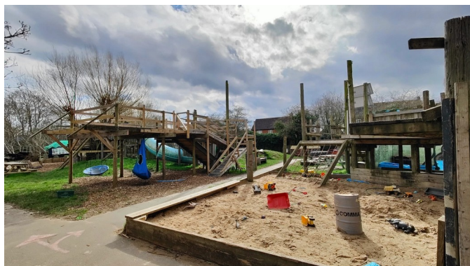
The Playground itself