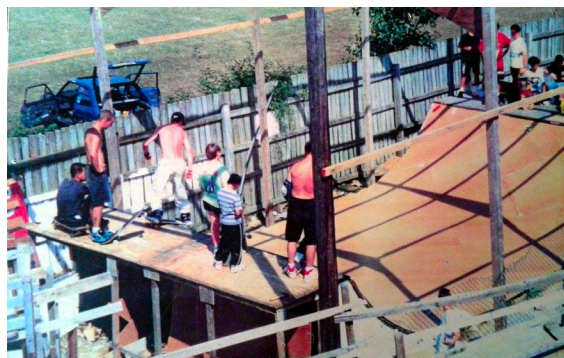
Early days at the Playground

Over the years, there's been much change, and it's shifted from the core definition of "playground" into something much, much more. It's now a child- and family-centred community asset, providing a whole host of services to the local community and beyond: while they focus on the immediate community, they have visitors from across Worcestershire and neighbouring counties.