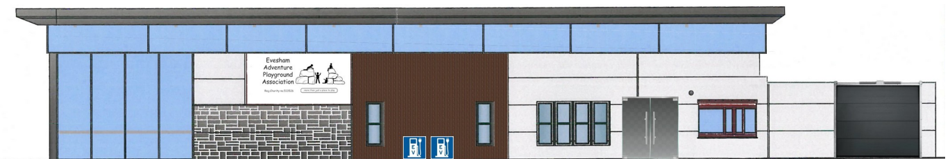
Concept Drawing of New Community Hub (which will inevitably change!)

If you prefer – and it would certainly help us if you could, please – you can access and complete this survey online this using this link . Please, give us your views, and help us to shape the case for this new Community Hub. This closing date for this consultation is midday on Monday, 22nd of April, 2024 .