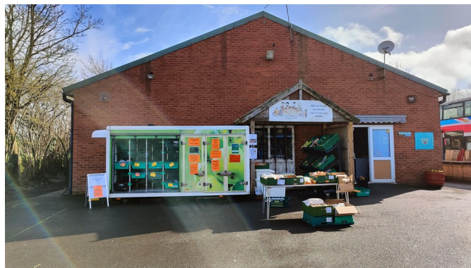
The Community Pantry

The Playground has become an indispensable community asset for so many people. To give you some idea of the scale, in 2023 they: